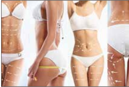
MESO COCKTAILS FOR BODY, STOMACH, HIPS, AND LEGS