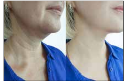
MESO COCKTAILS FOR NECK AND DÉCOLLETÉ