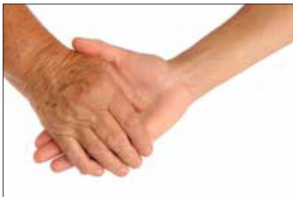
MESO COCKTAILS FOR HANDS