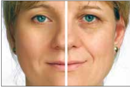
MESO COCKTAILS FOR THE FACE