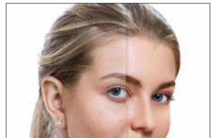
MESO COCKTAILS FOR SKIN QUALITY AND GLOW