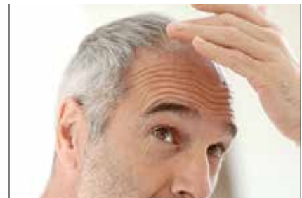
MESO COCKTAILS AND PRODUCTS AGAINST HAIR LOSS