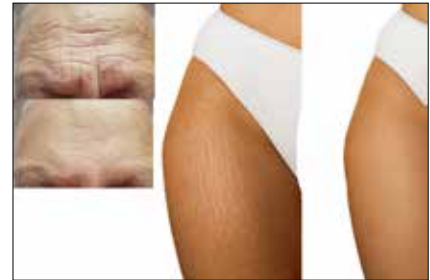
MESO COCKTAILS FOR STRETCH MARKS, SCARS, AND DEEP WRINKLES